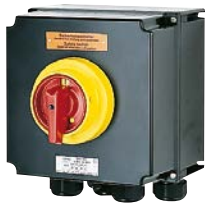
6-pole EMERGENCY STOP