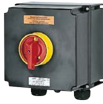
3/4-pole EMERGENCY STOP