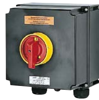
3/4-pole EMERGENCY STOP