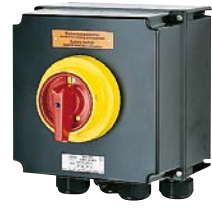
6-pole EMERGENCY STOP