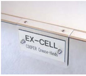
ID TAG label & bracket