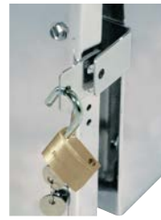
Security padlock Hasp opti.