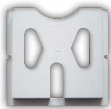
Door document holder opti.